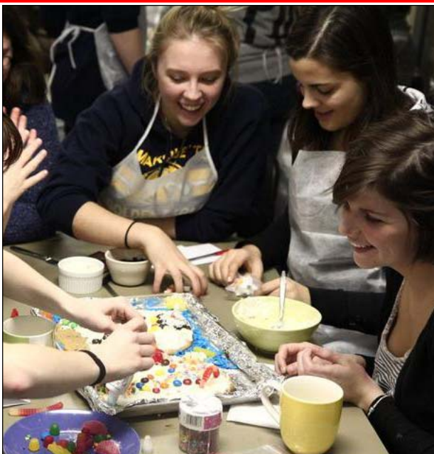
The girls at Chef's Night

This semester started off with a great Recruitment Week! We hosted a variety of events, like our Night in Paris, where we had fondue and crepes with the Skulls, and our service event where we made tie blankets to donate to charity with the Delts. At the end of the week at Preference Dinner, we gave bids to seven girls and six of them accepted. Over Camras Weekend, Kappa hosted nine great girls at our house, and we all relaxed with our Be a Kid Again event with Tri-angle, where we finger painted, played with legos and play-doh, and watched Toy Story. After meeting these prospective new members, we're excited