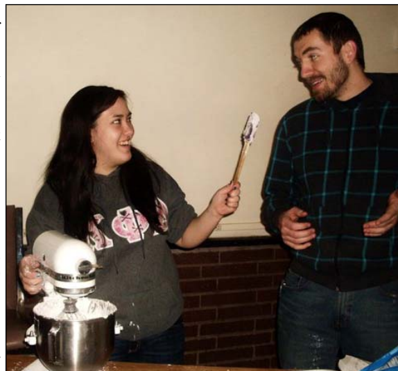
Baking with the Skulls

*Editor's note: article submissions were accepted during the middle of April. Some events had occurred by time of print.