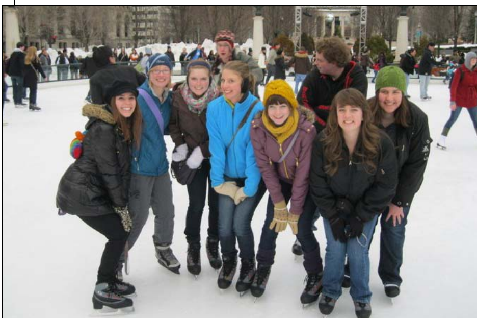
Kappas at Millenium Park ice rink with the Alpha Sigs

about Kappa's history as well as working on their various projects and interviews. Walkabout this year was themed "Climates around the World" and involved a scavenger hunt around the house. Initiation will be held when they return to school in the fall.