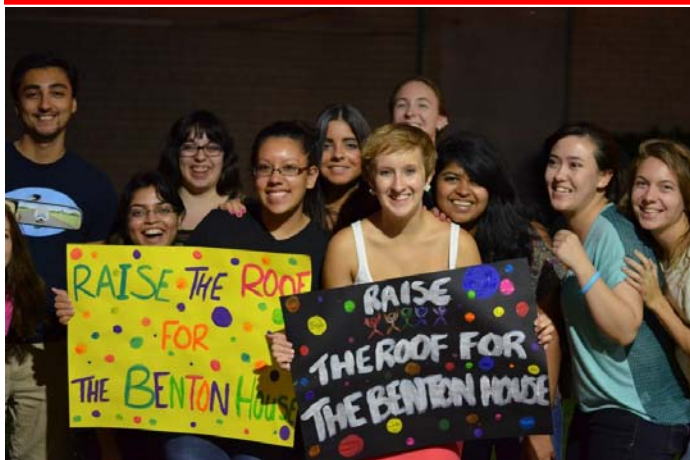
Kappa's philanthropy the Benton House, a neighborhood social service agency.

As a Chapter, Kappa has changed our primary philanthropy to Benton House during the Spring 2012 semester. Previously we had supported Susan G. Komen for the Cure and continue to promote this organization through annual volunteering at the Race for the Cure that took place this year on September 22. Our switch was attributed to the Chapter's desire to make an impact on the local level, primarily the neighborhood we live in.