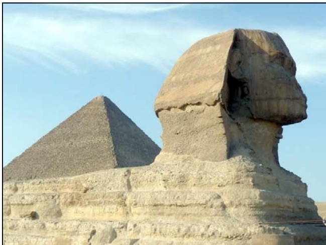
The Sphinx and pyramid.

We went to Egypt to see the antiquities. Seeing the pyramids and temples was high on our "bucket list." Instead, we got caught up in the revolution. And we learned two important lessons: what a lifeline the Internet has become for just about everything we do; and how precious it is to be an American.