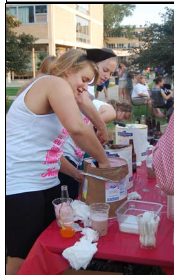
Kappa Floats during Rush Week