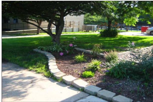
Some of this summer's handiwork

Despite the morning rain on June 5th, a few alumnae and actives got their green thumbs together to do spring weeding and planting in the Kappa Phi Delta garden. The garden has expanded and changed shape over the years, at one time including a vegetable patch and one, lone cantaloupe (accidental!), but now it includes a nicely bricked patio with picnic tables and fire pit. The peony bushes that were planted over six years ago have grown tall and full, while the original tiger lilies that were a donation from someone's garden have been trimmed back to one side, rather than extending the full length of the house. One year, the sunflowers planted in the northwest corner grew taller than all of the actives and then